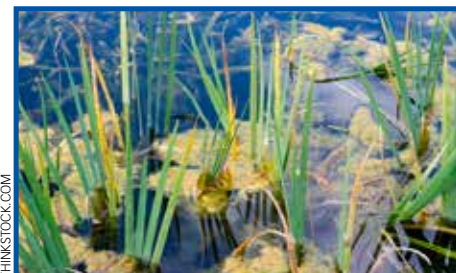
Blue-green algae can produce several toxins.

These algae can produce several major toxins. Some algae produce potent neurotoxins that cause clinical signs such as muscle tremors, respiratory distress, seizures, profuse salivation,