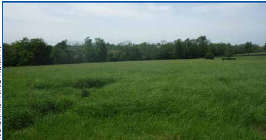
When managed properly, high-quality pastures can reduce feed costs.

If excessive weeds are the main reason you're renovating your pasture, one application of glyphosate might be sufficient for most weeds. If tall fescue or nimblewill are present, a second spray