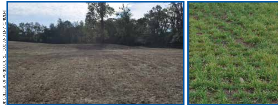
Undesirable pastures are good candidates for re-establishment, but they require a several-month rest period from grazing for forage growth.

without covering the seed has proven to be ineffective and therefore is not recommended. Also, seed at the proper depth. (For most forages, the proper seeding depth is ¼-½ inches.) One of the main causes of establishment failure is seeding at the wrong depth. Check that the seeder is calibrated correctly and is actually putting the seed in at the proper depth.