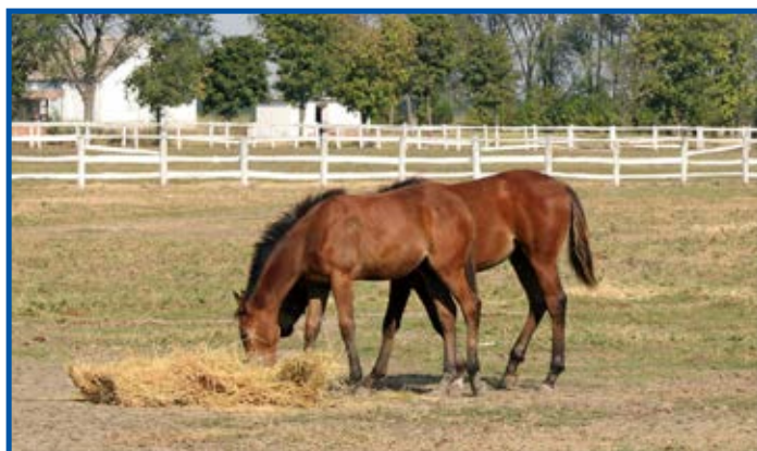
Weanlings had similar digestive capacities as mature horses.

The research team paired six weanling colts with six mature geldings (with an average age of 13.2 years) and allowed them to adapt for 21 days to a diet