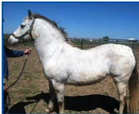
"Roanie" and "Biscuit" are two of UK's PPID and EMS research horses, respectively.