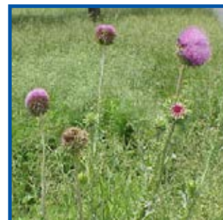
Mature, flowering plant