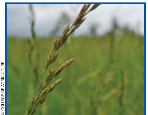
UK COLLEGE OF AGRICULTURE