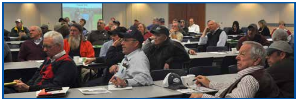
The 100+ crowd at the Alfalfa Conference included producers and growers, county agents, NRCS agents, and more.