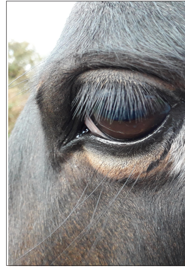
Figure 2. Horse 2½ years after treatment.