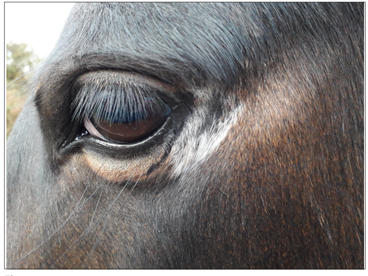
Figure 2. Horse 2½ years after treatment.