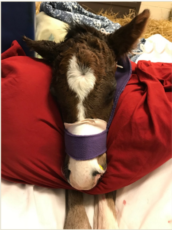
Figure 3. Septic foals are often excessively lethargic and can be unable to stand without encouragement and assistance. Good nursing care is an essential part of treatment.