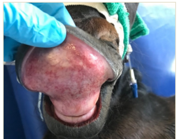
Figure 1. Injected mucous membranes in a hospitalized foal—abnormal coloration of the mucous membranes is a common clinical sign associated with sepsis.