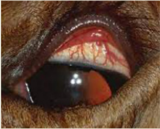
Figure 2. Injected sclera (whites of the eye) can be an early sign of sepsis in young foals.