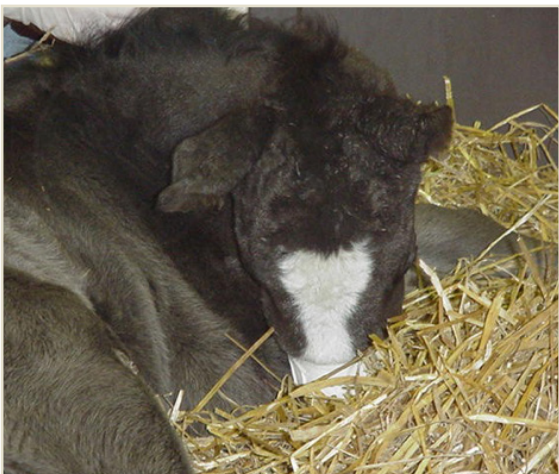
Figure 4. Neonatal foal showing abnormal behavior and response to stimulation.